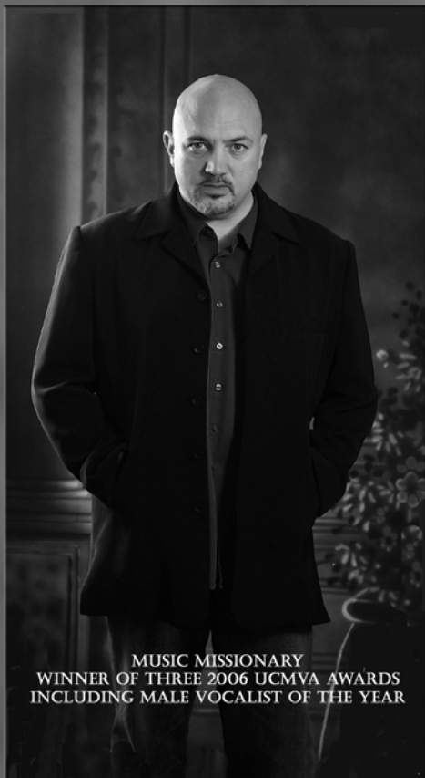
MUSIC MISSIONARY WINNER OF THREE 2006 UCMVA AWARDS INCLUDING MALE VOCALIST OF THE YEAR