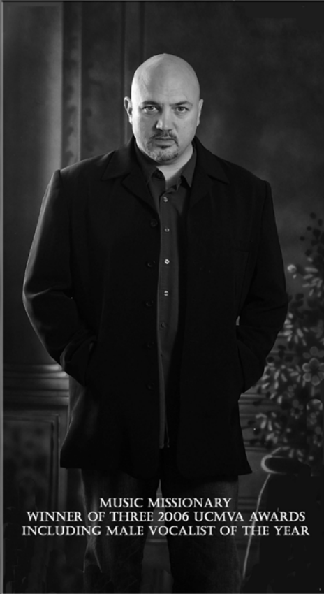
MUSIC MISSIONARY WINNER OF THREE 2006 UCMVA AWARDS INCLUDING MALE VOCALIST OF THE YEAR